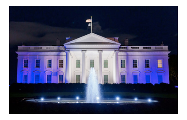
The White House ~ Washington, D.C.