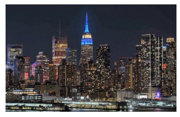
The Empire State Building ~ New York, NY