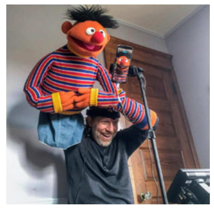
Muppets have been delivered to puppeteers' homes so Sesame Street can continue taping.