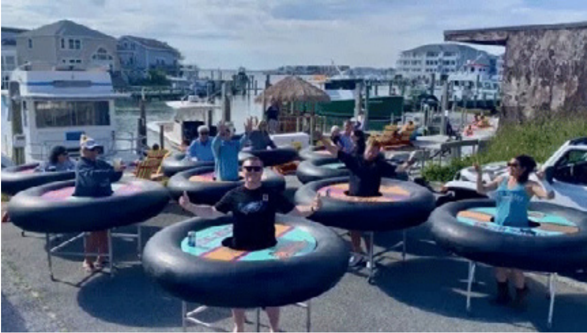
Diners at a Maryland seafood bar use giant inner tubes on wheels to physically distance