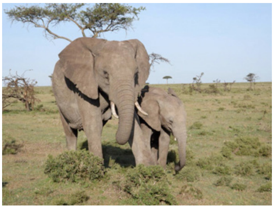
to illustrate last Sunday's sermon: This is the Elephant Experience!